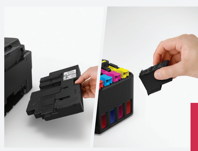
Ink Maintenance Cartridge